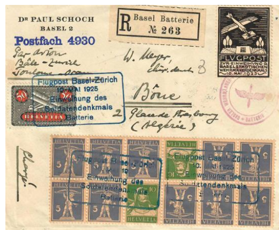
registered cover: Basel-Bône (today Annaba), 10.5.1925, with special flight from Basel to Zurich

I am passionate about historical research and it is my goal to collect documents and philatelic material for the future to enable a kaleidoscopic glimpse into the relation between Switzerland and French Algeria.