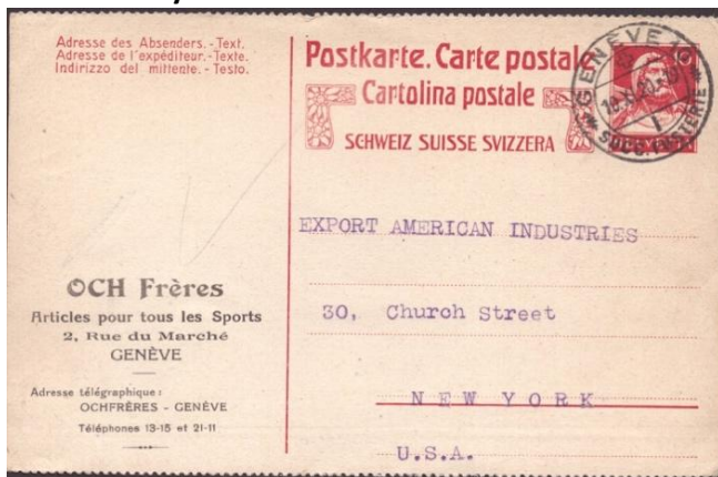
One of the rarest postcards of Switzerland

I switched from collecting stamps to postal stationery in 1960. Initially Great Britain and Colonies, but as time passed, the collection included worldwide. I worked for the Higgins & Gage auction company in 1971 for three months and learned how it was composing its new worldwide postal stationery catalog. At the time, it was compiling the "S" countries. There is a history of my philatelic journey, and the operation of the H&G company, in the January-February 2013 issue of "Postal Stationery" magazine. I became its editor in 2001, and president of the United Postal Stationery Society.